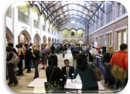
Students visit our annual Career Fair.

http://globalhealth.washington.edu/resource-center/get-connected-global-health