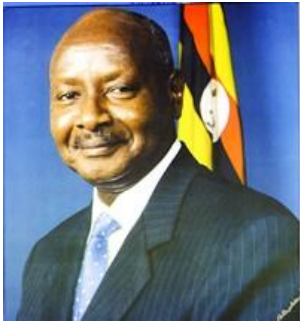
President Yoweri Museveni

Uganda became an independent country in October 1962 with Milton Obote as Executive Prime Minister. Two decades of military coups and counter-coups followed, during which millions fled the country and over a million people were murdered. The most infamous dictatorship was that of Idi Amin, who seized power in 1971 and for over a decade presided over massive human rights abuses and economic decline. (Among other things, he cast the Indian minority out of Uganda, which resulted in long-lasting damage to the Ugandan economy). Amin's rule ended after his troops invaded Tanzania in 1979. The Tanzanian military repulsed the incursion, and ousted Amin from power. A second brutal Obote regime followed, until he was unseated by the military general Tito Okello in 1985. Six months later, Okello was toppled in turn by the current president, Yoweri Museveni. Museveni has since been re-elected four times, most recently in February 2016, becoming the longest-serving leader in all of East Africa. In April 2011, growing opposition to Museveni's rule, led by Kizza Beysige, led to street protests. Government forces responded with a massive crackdown, during which at least nine people were killed.